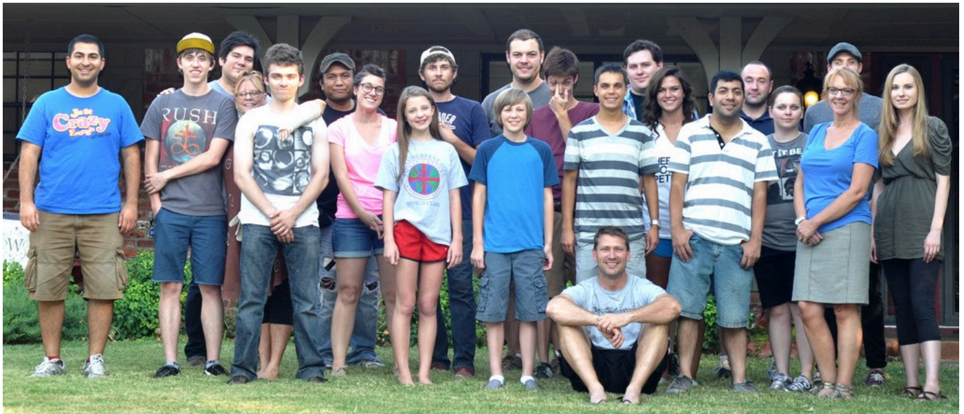
The Cast and Crew of No One Knows.